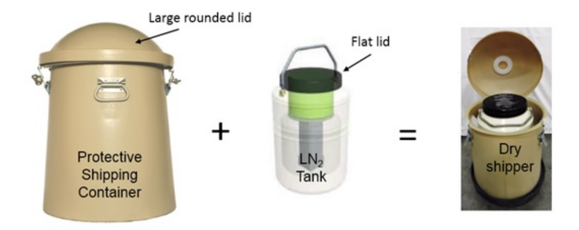
Figure 1: Dry shipper components and configuration

CLEVECORD is shipped frozen inside a steel canister placed inside a liquid nitrogen (LN<sub>2</sub>) charged tank specifically designed to keep the temperature at or below -150°C (dry shipper). Dry shippers consist of a protective shipping container with a large rounded lid, carrying a LN<sub>2</sub> tank with a flat lid (see Figure 1). CLEVECORD must be stored at or below -150°C either in the LN<sub>2</sub> tank inside the dry shipper for short-term storage (up to 48 hours), or inside a LN<sub>2</sub>-cooled storage device at the Transplant Center for storage greater than 48 hours. Recharge the tank with fresh LN<sub>2</sub> if CLEVECORD is to remain stored in the dry shipper for more than 48 hours.