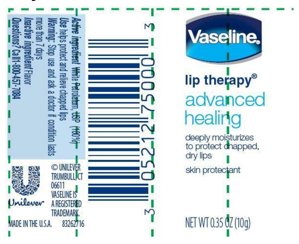
0.35 oz Back Card