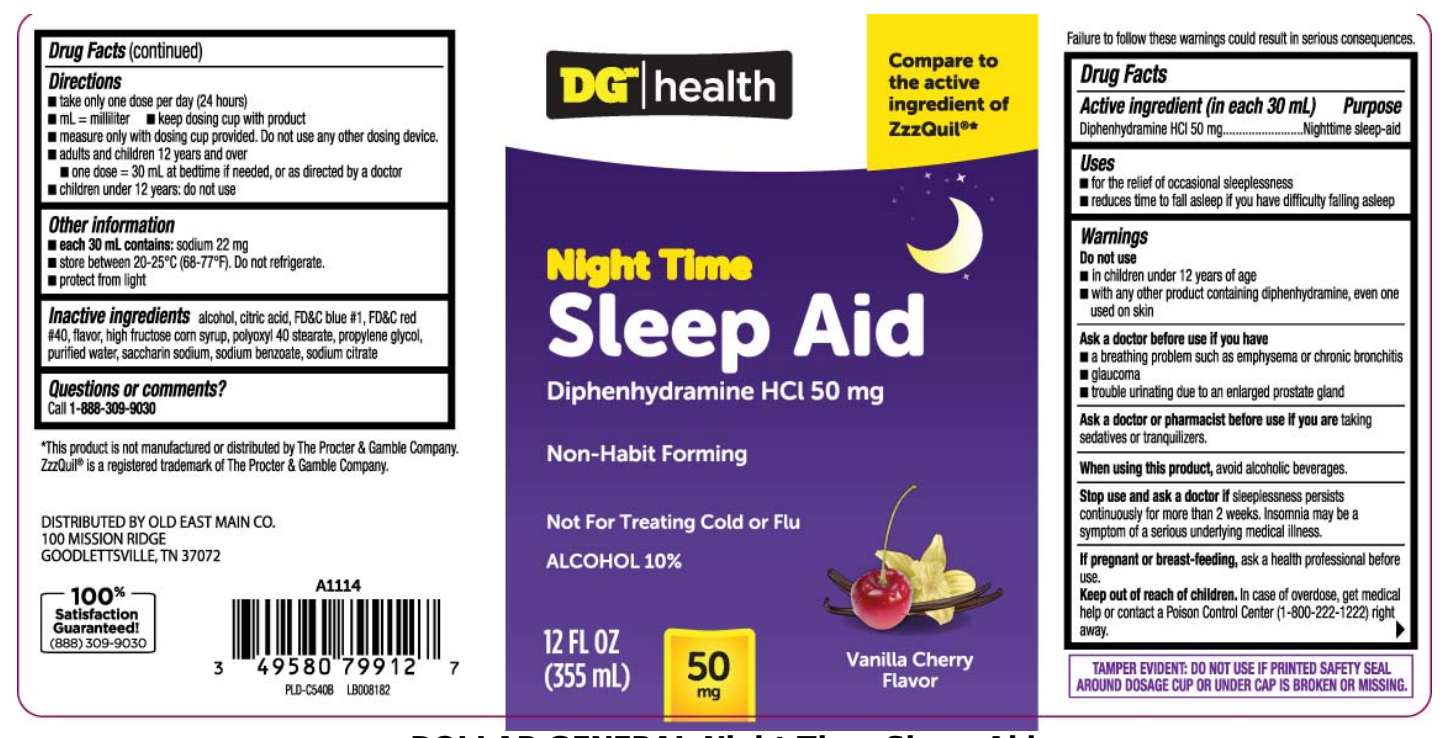
DOLLAR GENERAL Night Time Sleep Aid