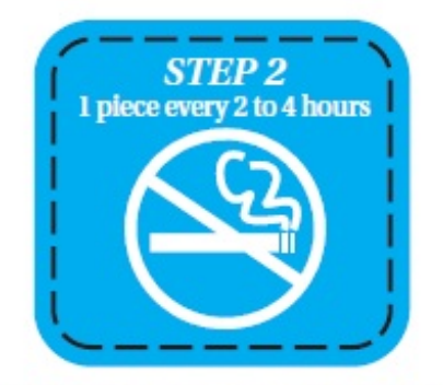
At the Beginning of Week #7