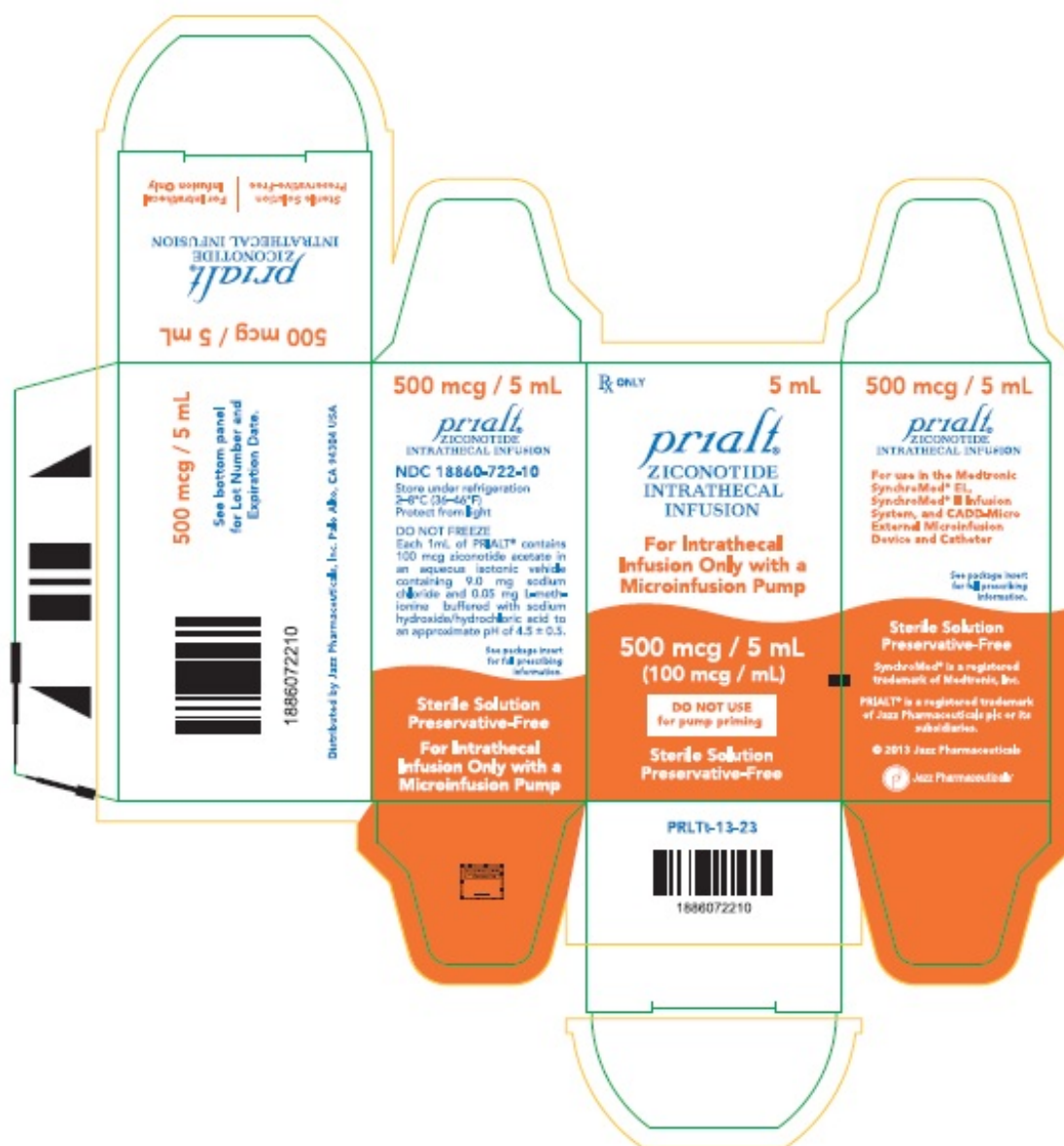
Carton - 5 mL