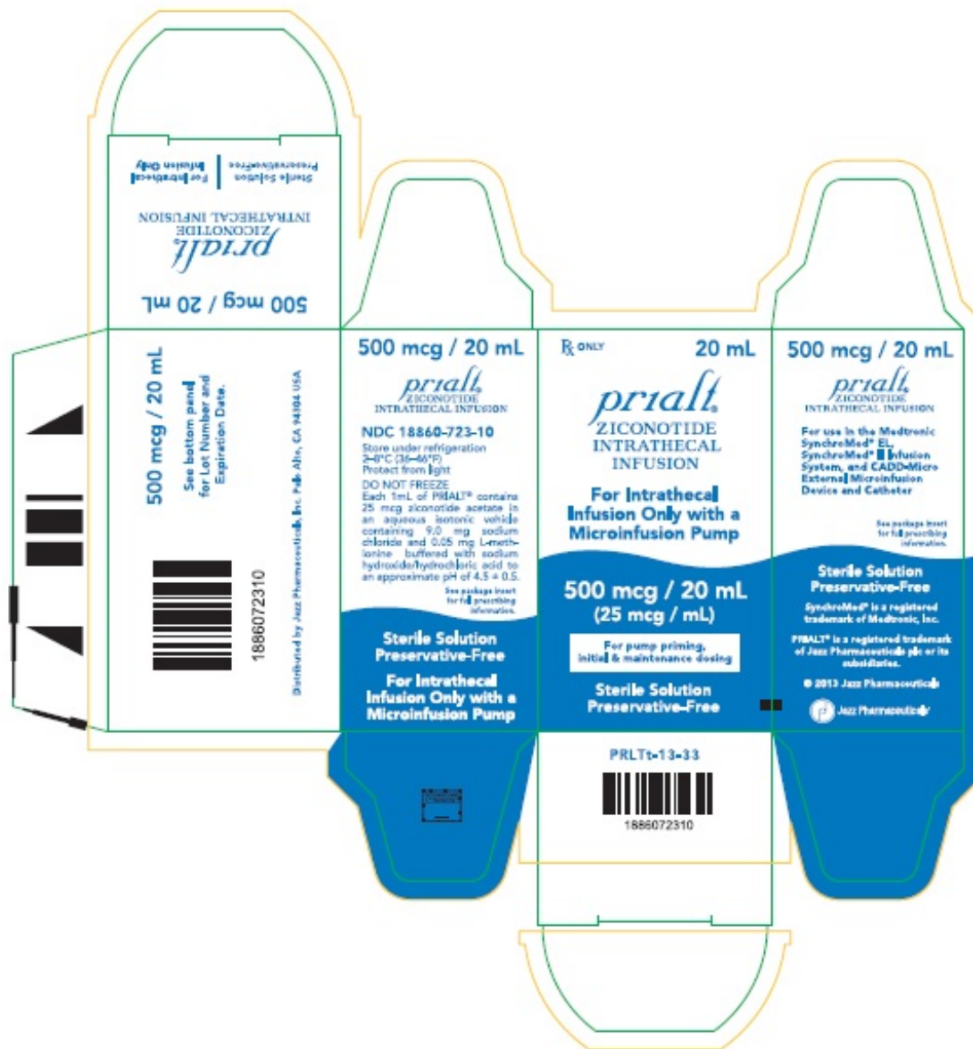
Carton - 20 mL