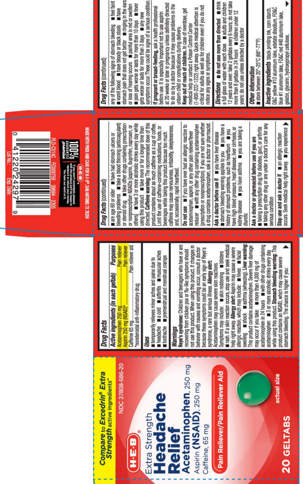
H-E-B Extra Strength Headache Relief

hydroxypropyl cellulose-low substituted, hypromellose iron oxide black, maltitol, povidone, purified water, stearic acid, talc, titanium dioxide