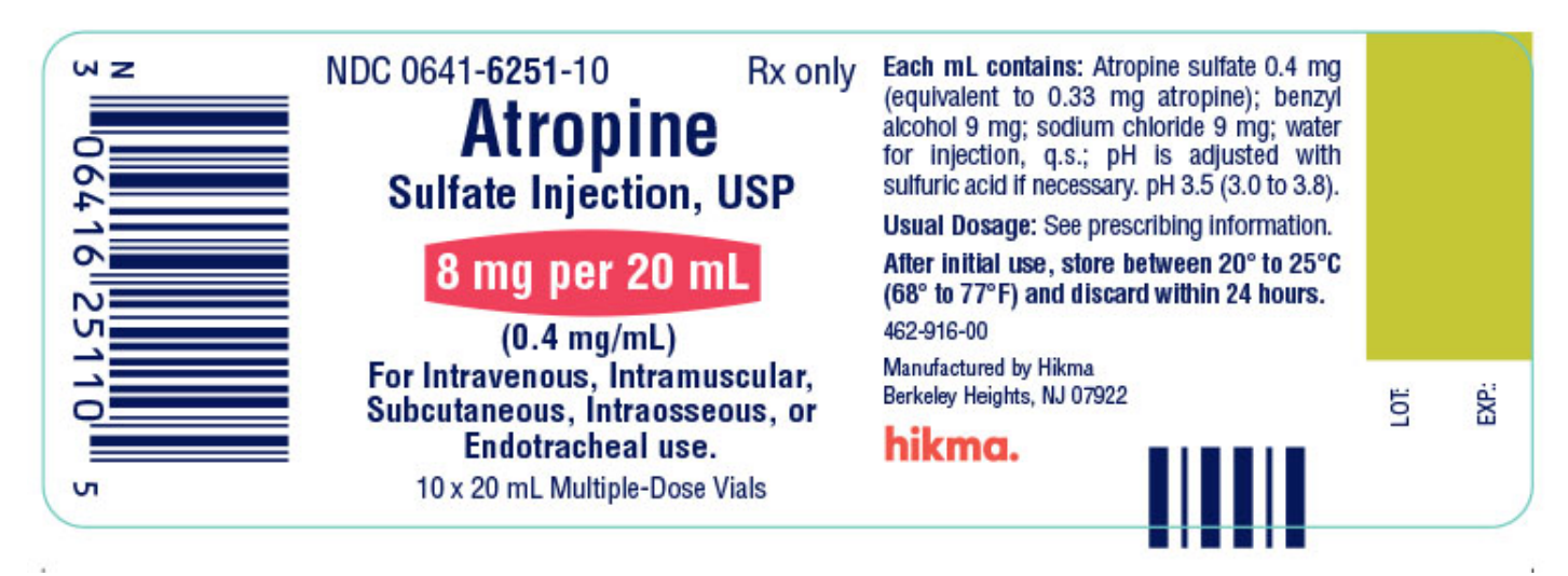
Atropine Sulfate Injection, USP 8 mg per 20 mL Carton Label