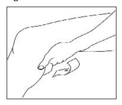
Step 4. If your healthcare provider has prescribed diclofenac sodium topical solution for both knees, repeat steps 2 and 3 for the other knee.