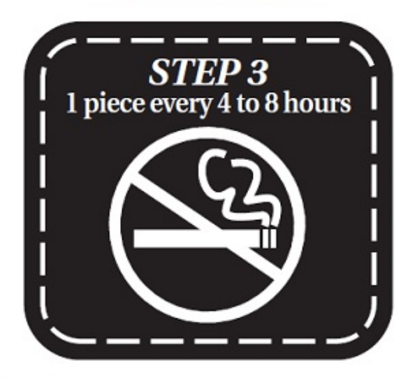
At the Beginning of Week #10