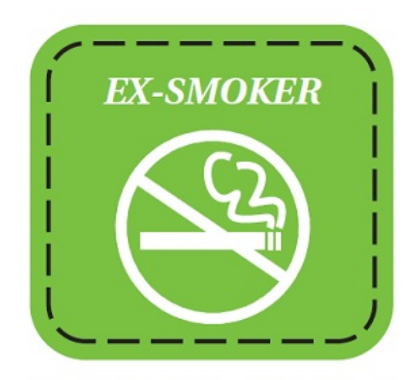
12 Weeks After Quit Date

Package/Label Principal Display Panel COMPARE TO the active ingredient of NICORETTE® GUM See side panel OUR PHARMACIST RECOMMENDED Nicotine Gum Nicotine Polacrilex Gum 4mg (nicotine) STOP SMOKING AID Includes User's Guide actual size Coated Ice Mint Gum