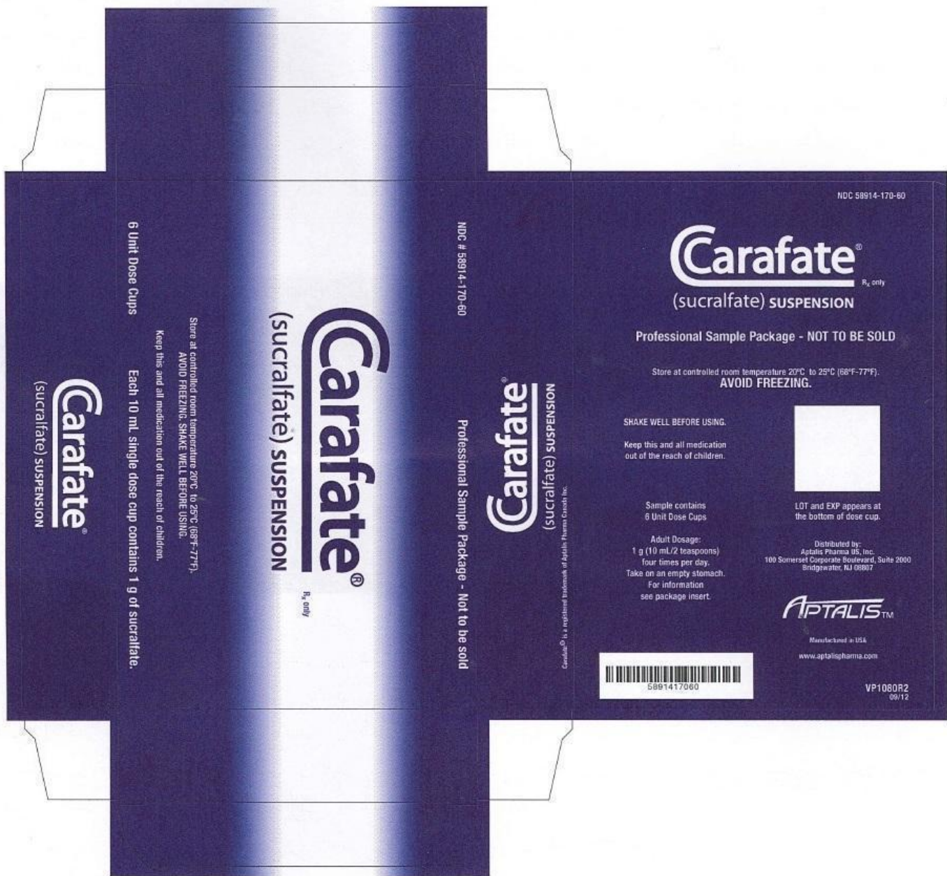
Carafate Suspension, Foil - Sample