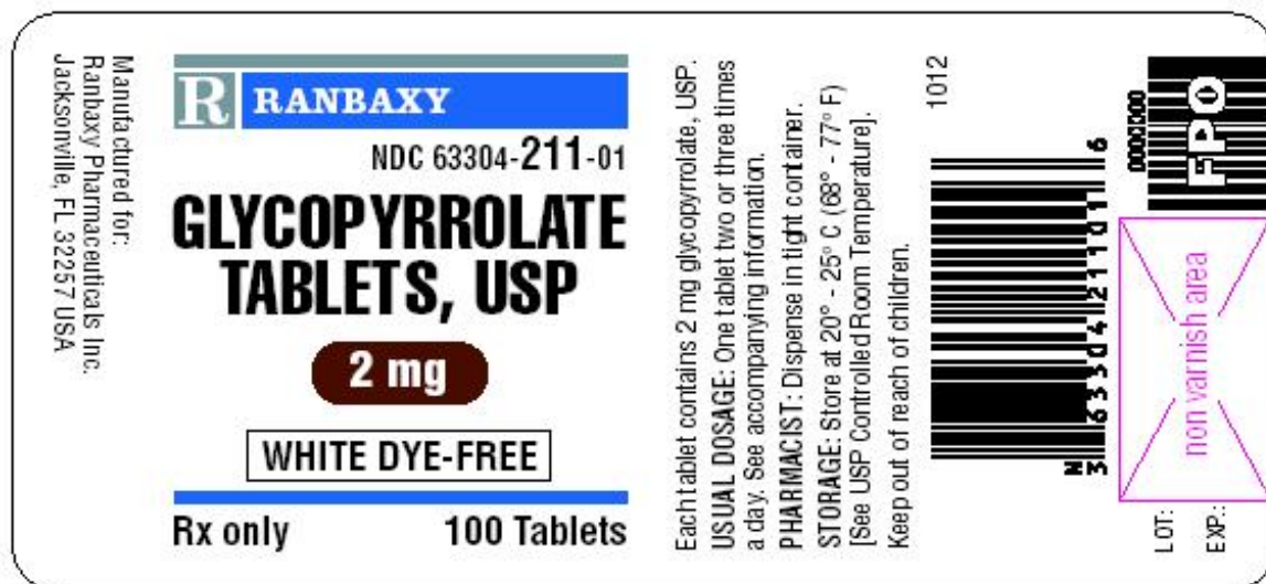
2 mg 100's bottle label