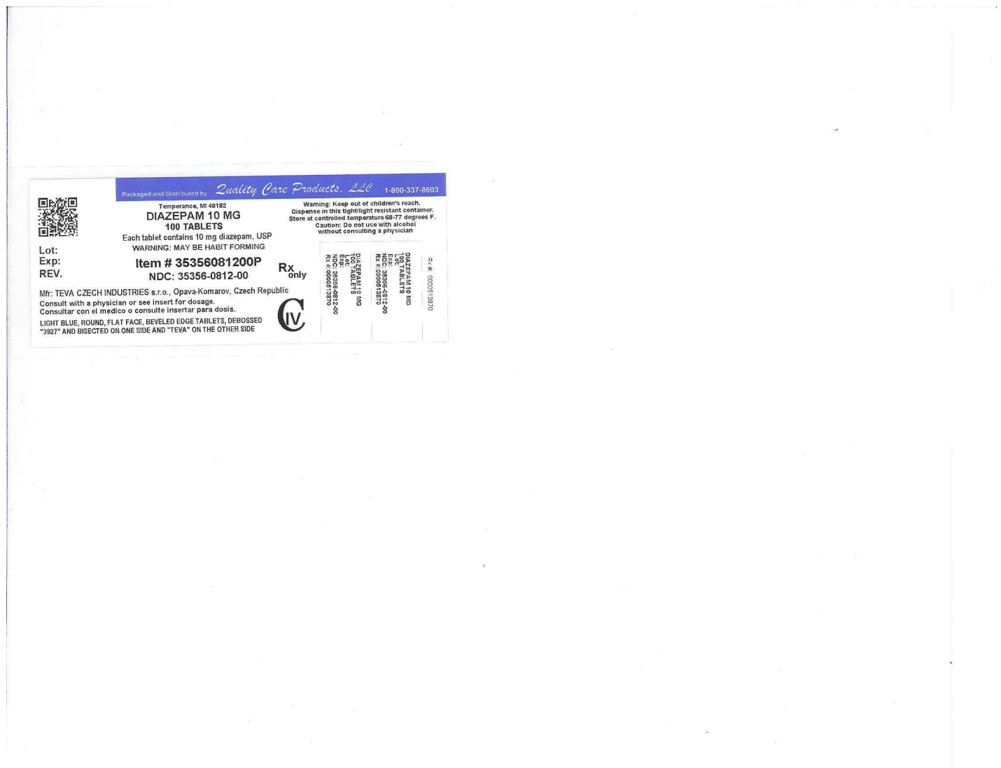
Image of Label