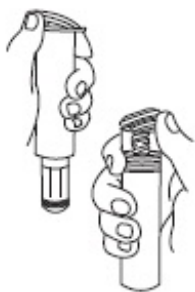
1. Remove protective caps.