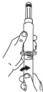
2. Thread vial into injector 3 half turns, or until stopper is pierced by metal cannula.* DO NOT PUSH VIAL INTO INJECTOR; THIS MAY CAUSE MISALIGNMENT.