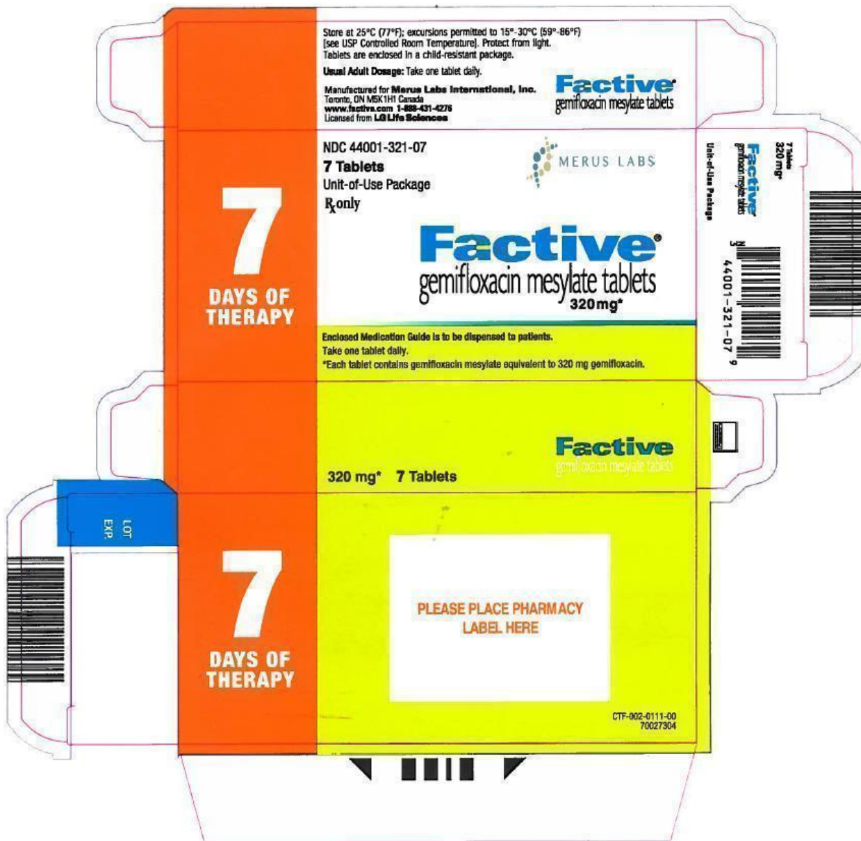
Factive 7 Tablets