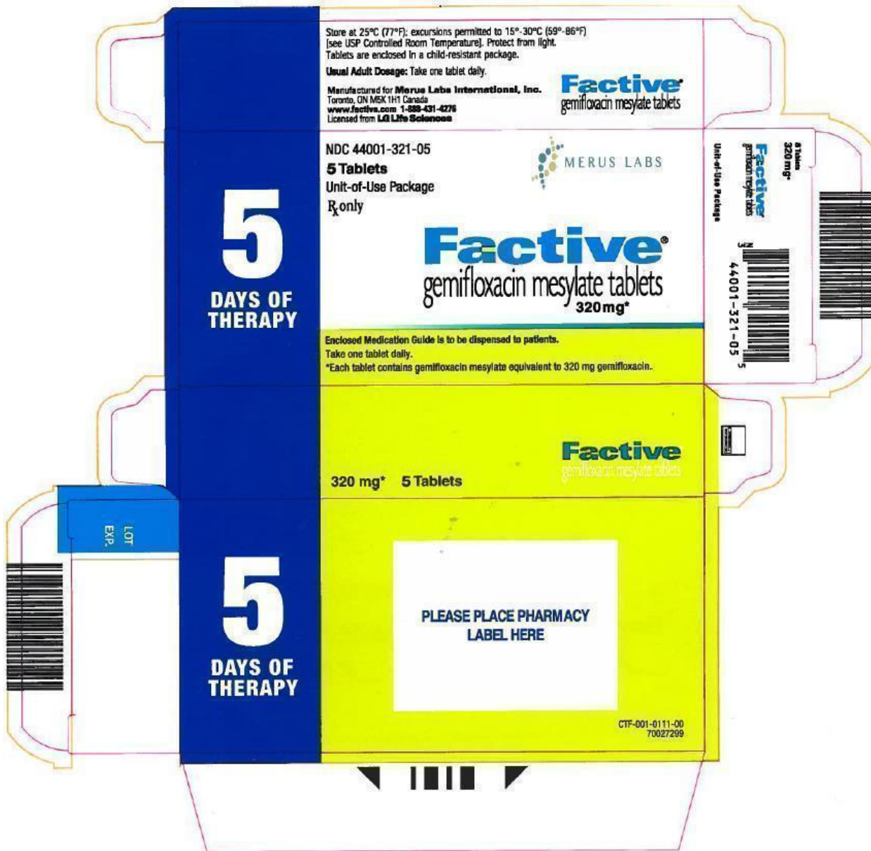
Factive 5 Tablets